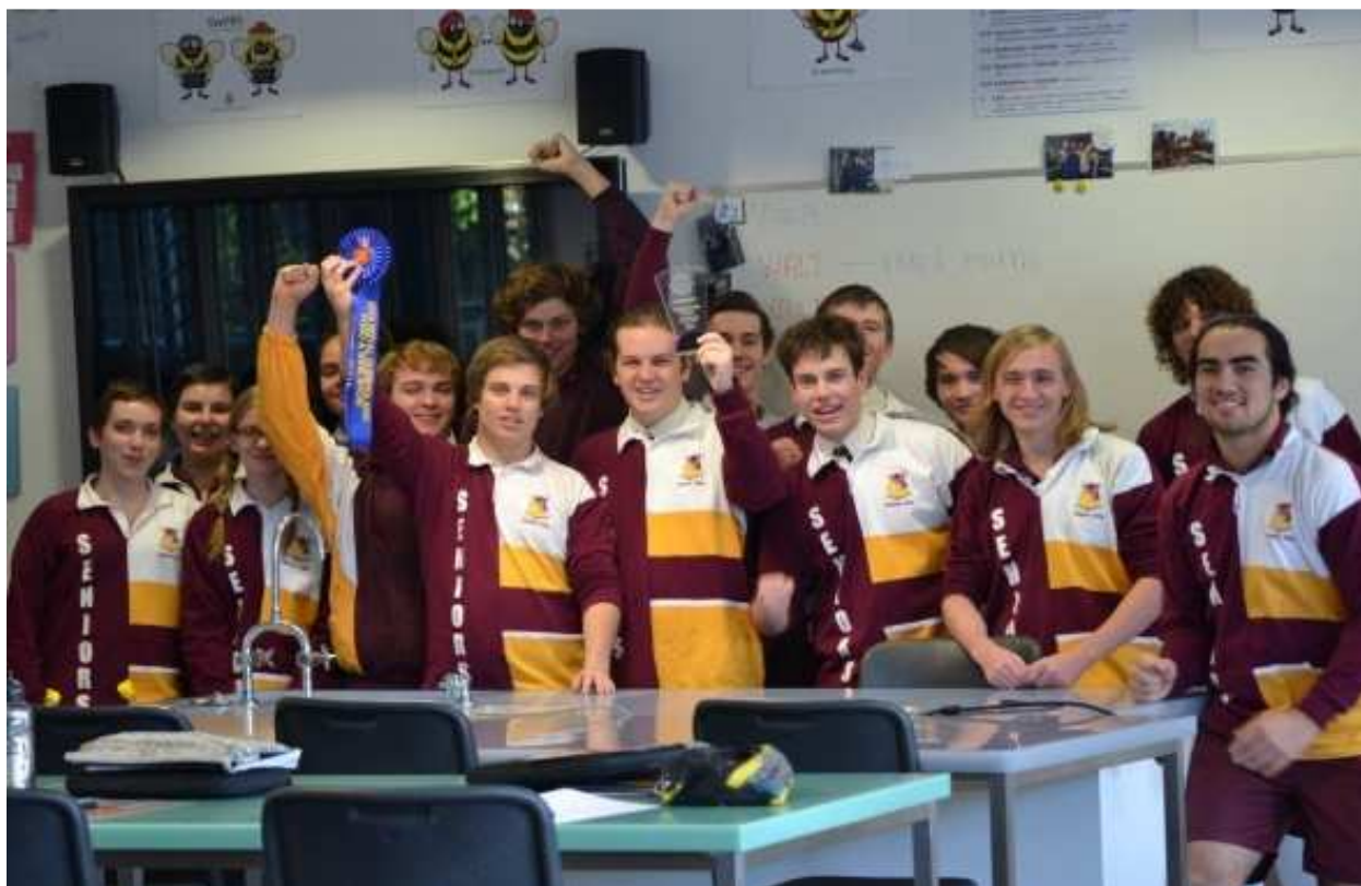
Year 12 Chemistry Class