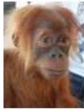
Chocolate Sex: Male DOB: June 2010