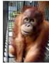
Ugo Blanco Sex: Male DOB: Feb 2007