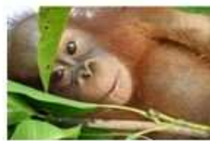
Bunga Sex: Female DOB: Nov 2009

The Year 10 Social Justice Committee would like to thank the whole school for such a wonderful effort in saving these beautiful creatures.