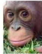
Monti Sex: Female DOB: Nov 2009