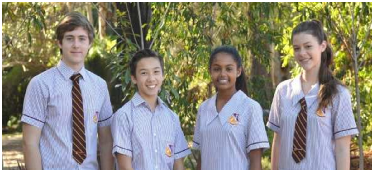
New Senior and Junior Secondary uniforms